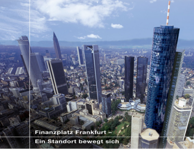
Finanzplatz Frankfurt – Ein Standort bewegt sich